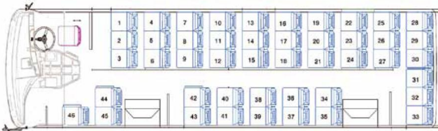
CHEETAH 203" - 3X2 LAYOUT - 46 SEATS