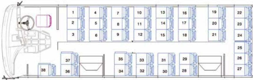
CHEETAH 176" - 3X2 LAYOUT - 38 SEATS